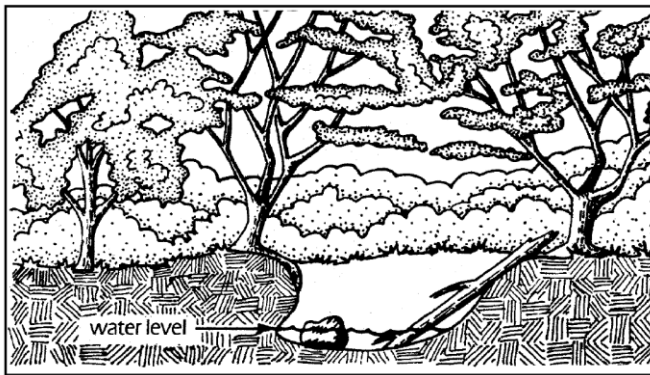
Minor stream obstruction

(line illustrations taken from " American Fisheries Society Stream Obstruction Removal Guidelines ")