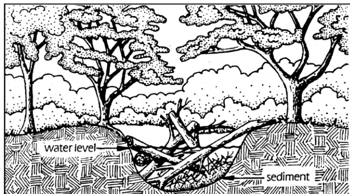
Moderate stream obstruction