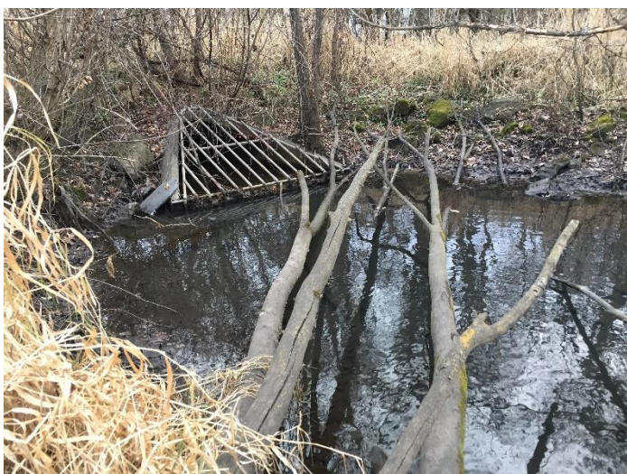
Figure 2. A stormwater outfall to the Vermillion River in Farmington.