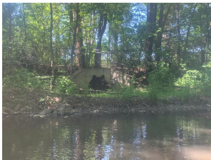
Figure 3. The Vermillion River in Hastings near a local bridge.

A grant from the Clean Water Fund, one of four funds established by the Clean Water, Land & Legacy Amendment, supports this project. Clean Water Stories can be found on the Minnesota Board of Water and Soil Resources website.